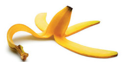
10. Banana skin