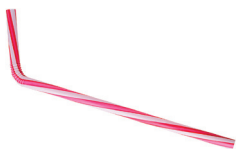
11. Plastic straw