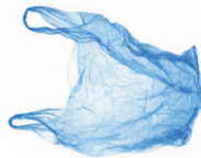
17. Plastic bag