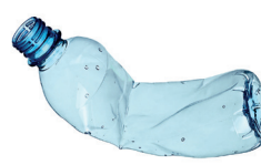
13. Plastic bottle