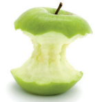
15. Apple core